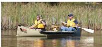
Radisson canoes aluminum