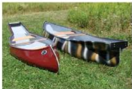
Cedar Ridge Canoes fiberglass