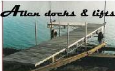
Allen docks & lifts