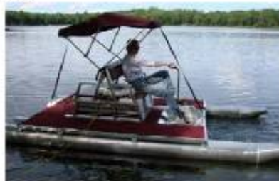
Paddle King paddleboats & LoPro pontoons