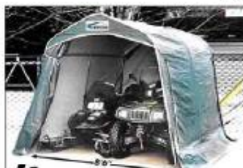
Harnois shelters & greenhouses