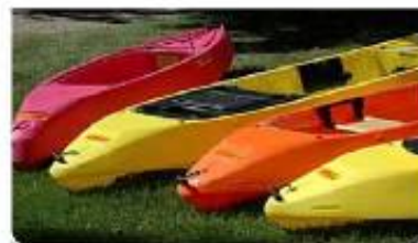
Kivi Kayaks sit in & clear bottom